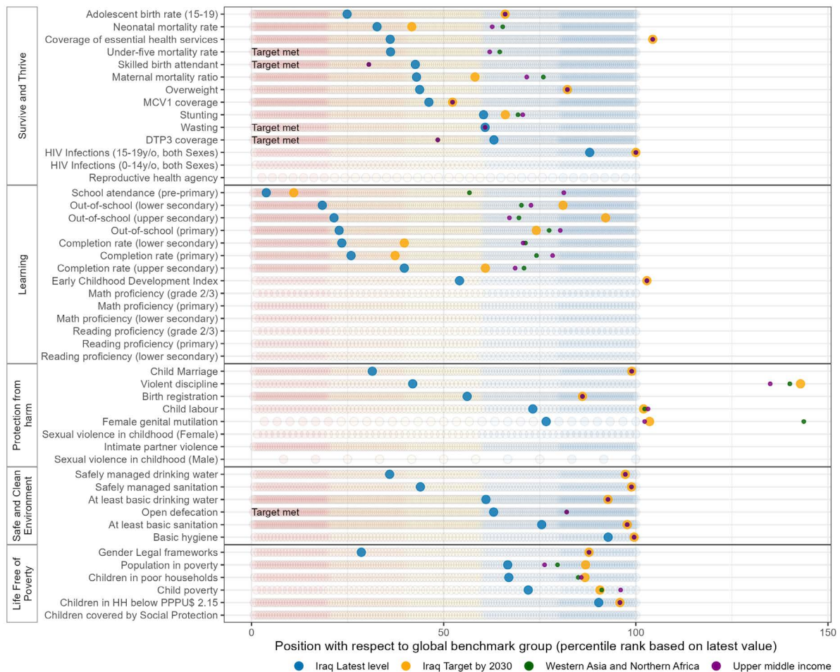
Figure 3. Benchmarking where the country is and where it aims to be by 2030

These findings have broad implications: first, they illustrate that the expected effort is not uniform across outcome areas (and respective indicators). This indicates that certain outcome areas (and specific results) may require more attention, resources, or effective strategies, highlighting the need for differentiated approaches. The point of this exercise is not to question or challenge the targets chosen but to offer a metric that can help inform expectations regarding the actions required to match these targets. This exercise also shows that for some indicators in some cases countries, the expected effort surpasses that in recorded history.